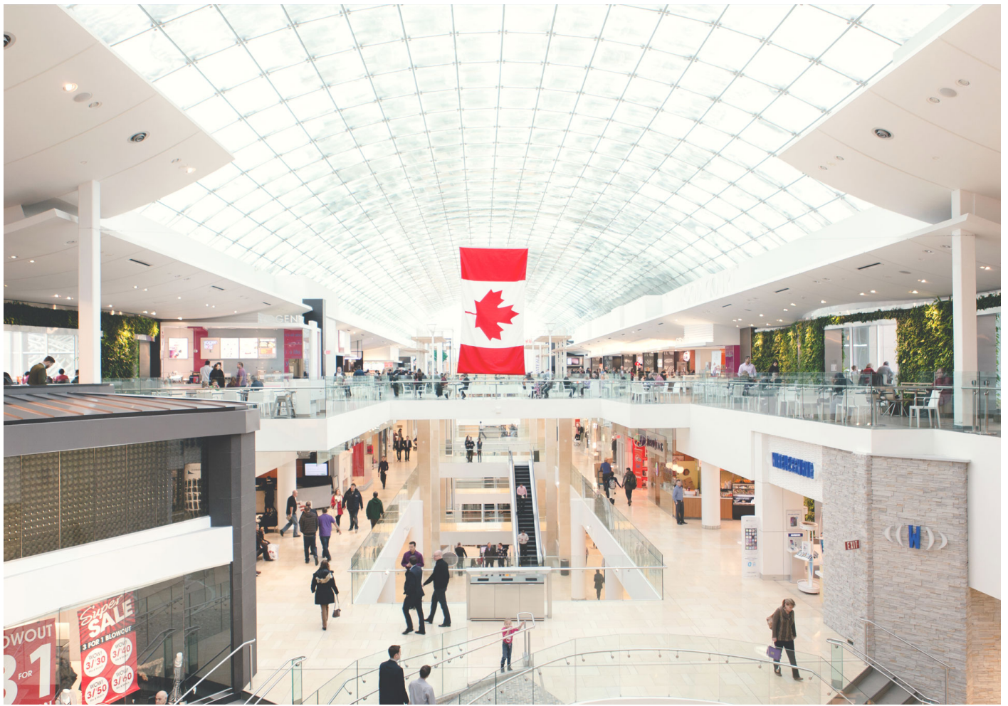
The CORE Shopping Centre is located in the heart of downtown Calgary and close to 3rd St. SW station.