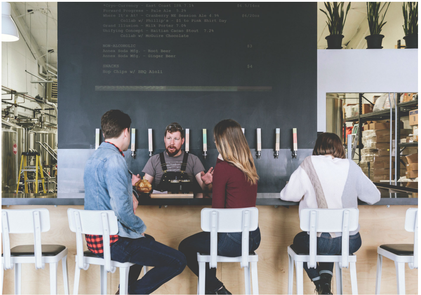
Stop for a pint in the Barley Belt at the Annex Ale Project, near 39th Avenue station.