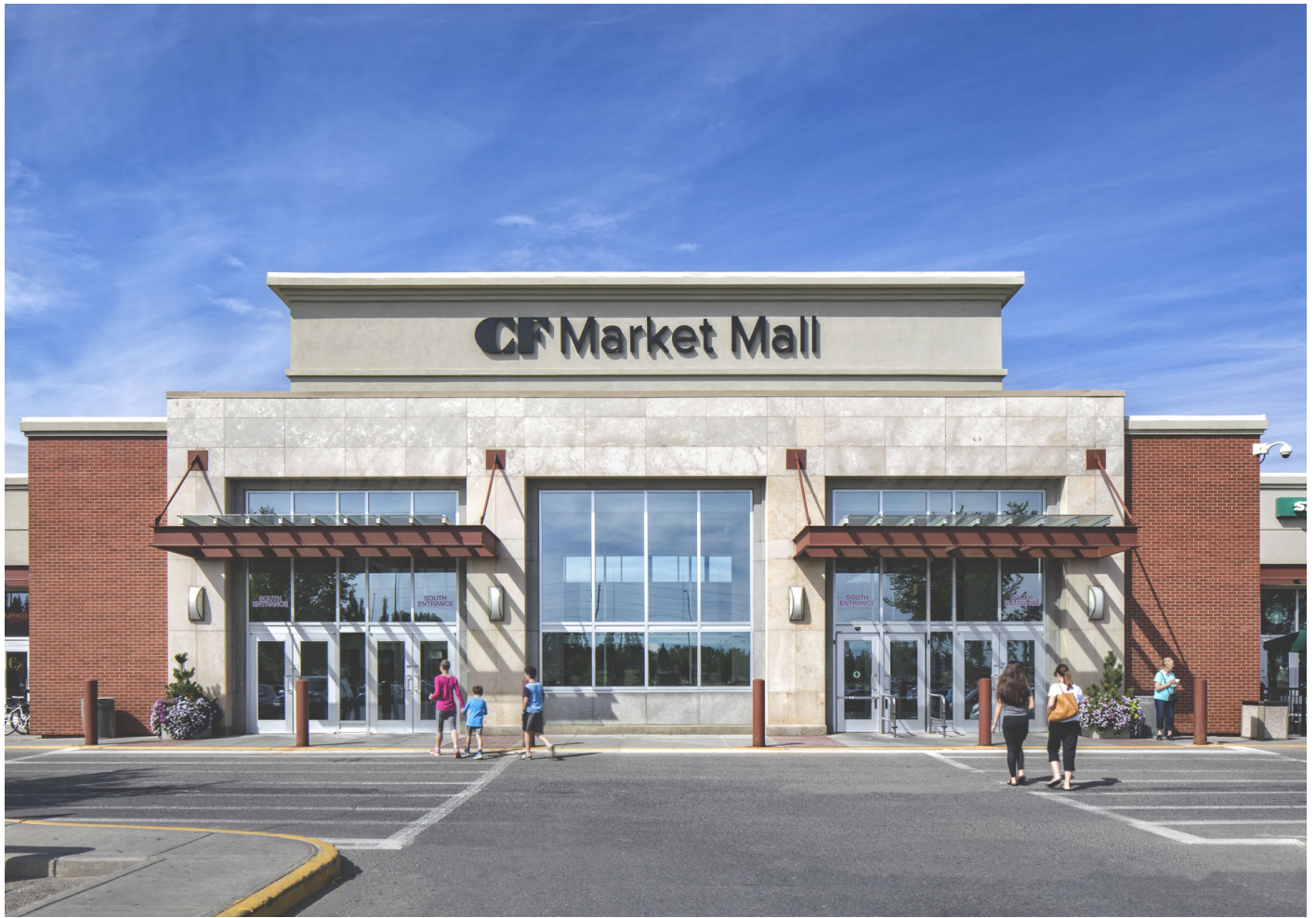
CF Market Mall is a short ride away from the Brentwood station.