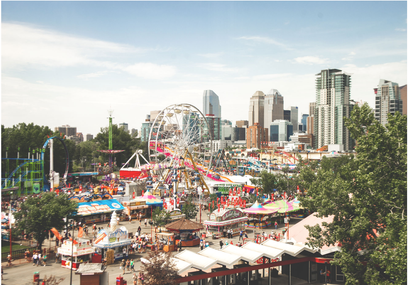
The Erlton/Stampede station is a great way to get to the Calgary Stampede.

114.058373312d51.038530511m511m11s0x5371700136412a5f:0xd95d87c05ff52d312m21d-114.055009912d51.040887613e2 ) is flanked on both sides by casinos. Check out Cowboys Casino ( http://cowboycasino.ca/ ) and the Elbow River Casino ( http://elbowrivercasino.com/ ) for great food, performances, and of course, to try your luck! https://goo.gl/8WWg8z ( https://goo.gl/8WWg8z )