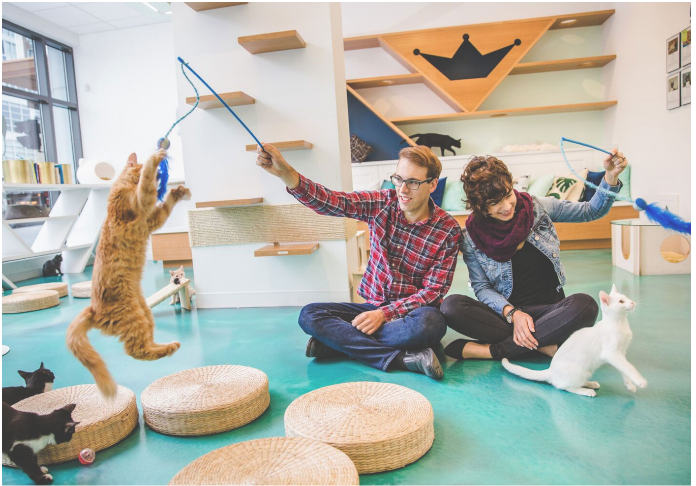
Meet some new friends at the Regal Cat Café near Sunnyside station (Photo credit: Adrienne Matthew).