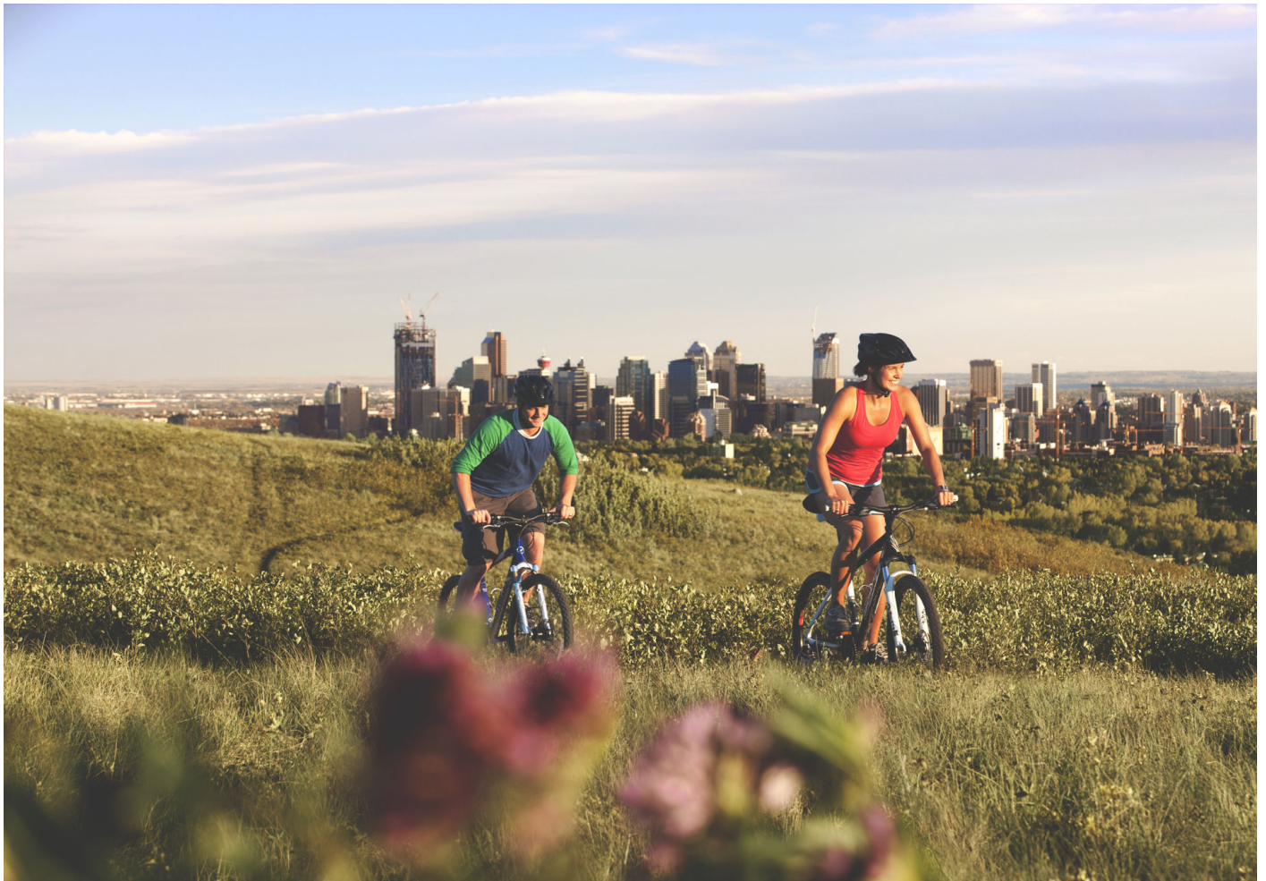
Mountain biking in Nose Hill Park – a short distance from Dalhousie station (Photo credit: Travel Alberta).

If you're in the area, why not catch a movie? Cineplex Odeon Crowfoot (https://www.cineplex.com/Theatre/cineplex-odeon-crowfoot-crossing-cinemas) is nearby, along with several other stores and restaurants ( here's your walking directions (https://goo.gl/gCs9rX) ).