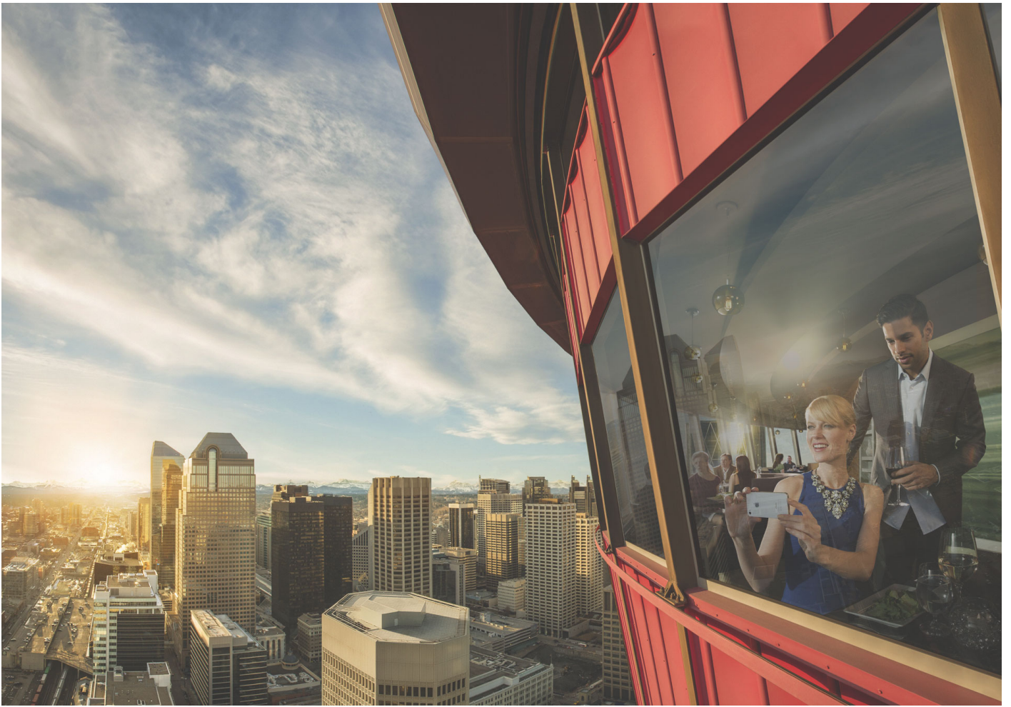
The Calgary Tower is a short walk from the Centre Street station.