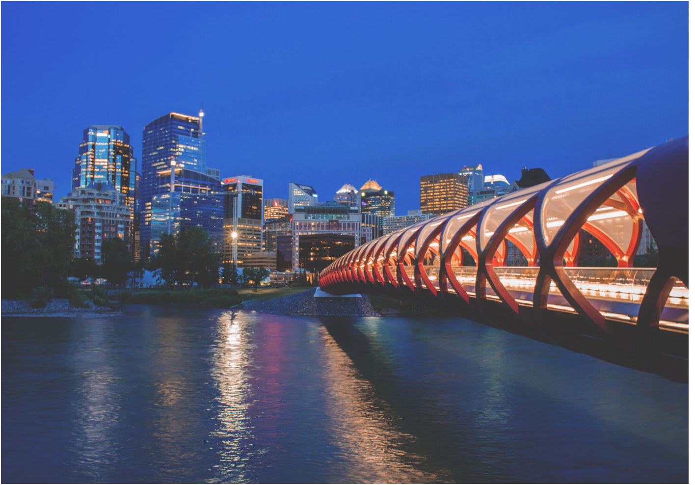
The Peace Bridge is a short walk from the 7th Street Station.