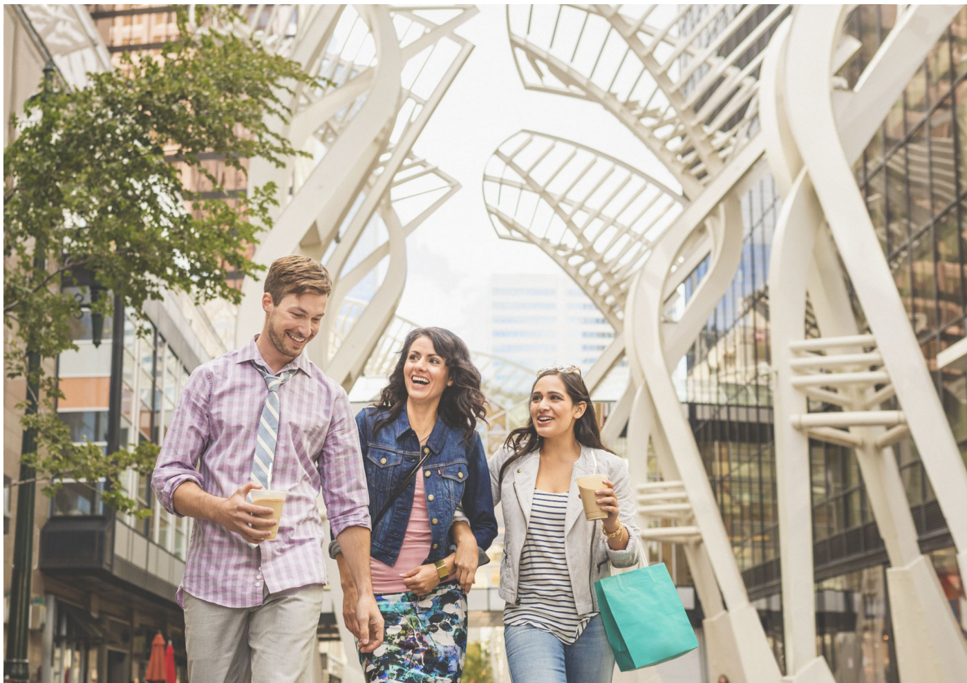
The Galleria Trees on Stephen Avenue near 1st St. SW station.