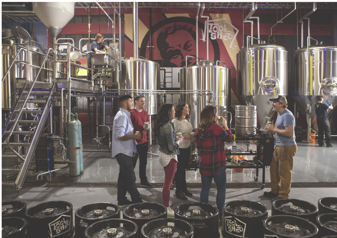
Take the train to Marlborough station to get to Tool Shed Brewery in Calgary