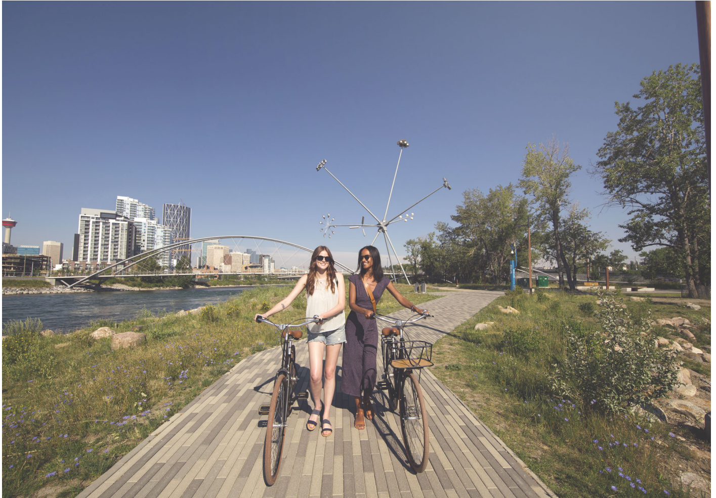
St. Patrick's Island and the George C. King Bridge, near Bridgeland/Memorial station

Canada's largest free outdoor skate (rollerblades/skateboards) park is right across ( https://goo.gl/XSyTVS ) the street from Downtown West-Kerby station, at Shaw Millennium Park ( http://www.calgary.ca/CSPS/Parks/Pages/Locations/Downtown-parks/Shaw-Millennium-Park.aspx ). It's a beautiful space that also often hosts events and includes a large green space. The Mewata Armoury ( https://www.pc.gc.ca/apps/difnd/page_fhbro_eng.aspx?id=2405 ) is also right next door, which is National Historic site of Canada built in the early 1900s.