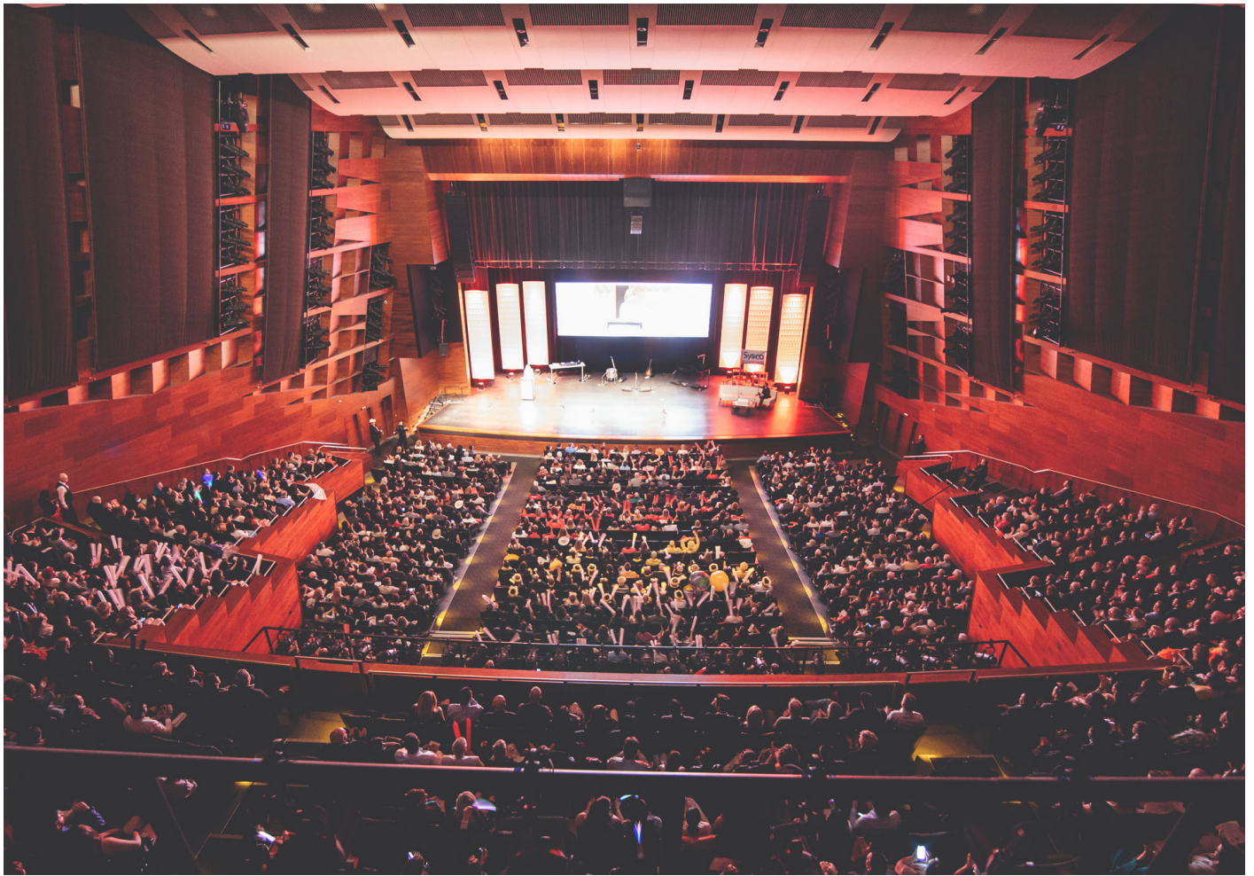
Take in a show at the Southern Alberta Jubilee Auditorium at SAIT/ACAD/Jubilee station.