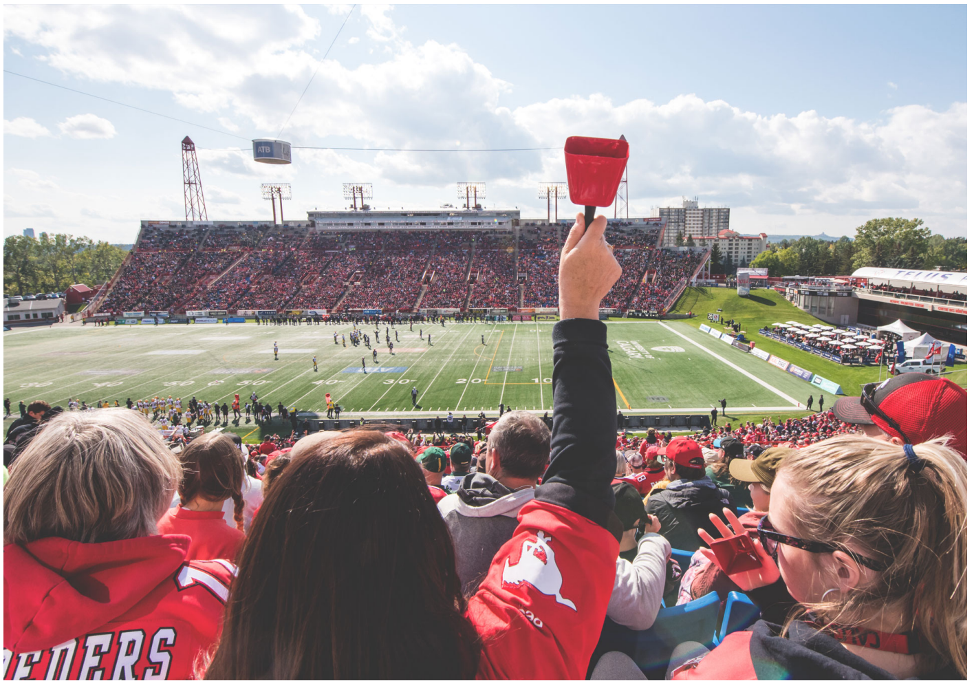
Catch Calgary Stampeders action at McMahon Stadium, adjacent to Banff Trail station.